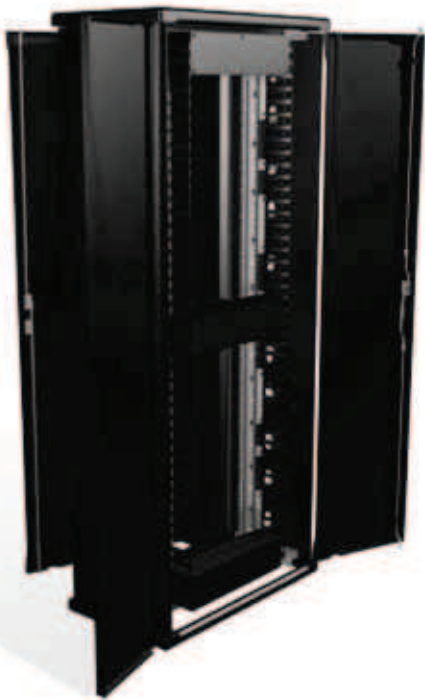
Brand-Rex Datacentre Cabinets and Racks High Density Copper Cabling Cabinet